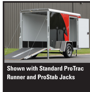
Shown with Standard ProTrac Runner and ProStab Jacks