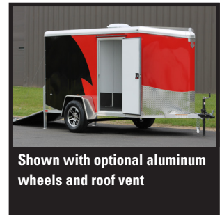
Shown with optional aluminum wheels and roof vent