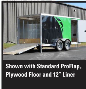
Shown with Standard ProFlap, Plywood Floor and 12" Liner