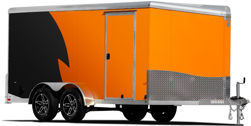
*Shown with Standard MikaD Slash.