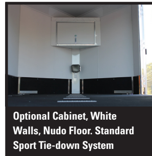
Optional Cabinet, White Walls, Nudo Floor. Standard Sport Tie-down System