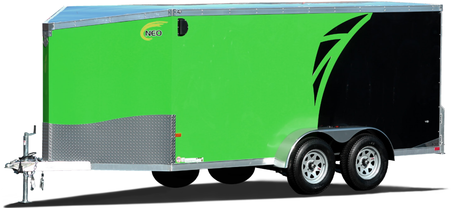
*Shown with Optional Bradley Slash