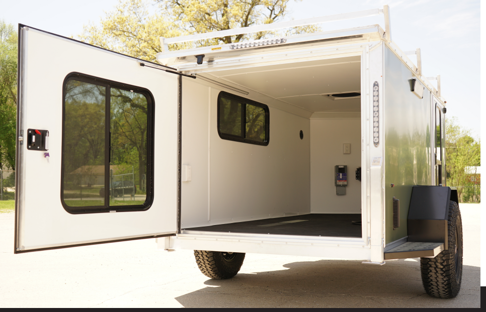
OPTIONS ADDED: 30A PANEL, NUDO FLOOR AND CABINET... TOYS NOT INCLUDED!